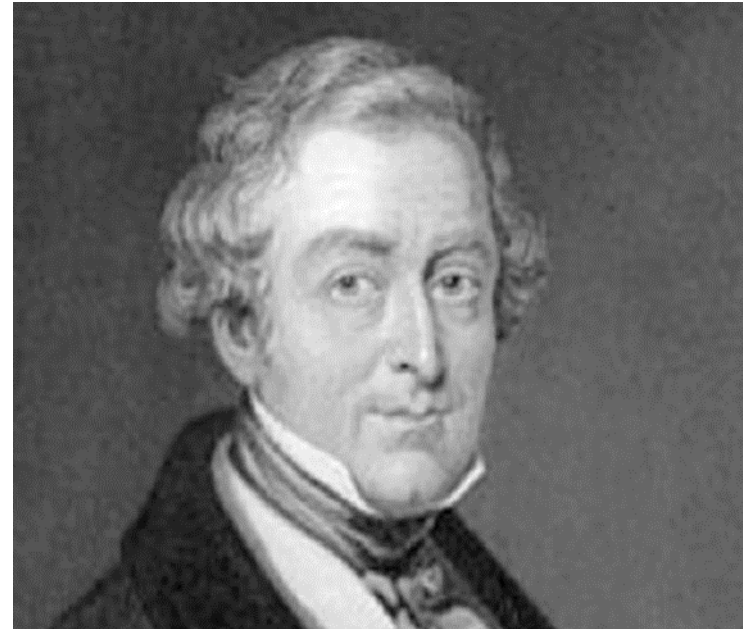
Sir Robert Peel 1788 - 1850

“The police are the public and the public are the police.”