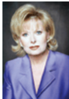
Senator Pamela Wallin will headline Convention 2011!

SUMA's 106th annual convention is nearing, and it's going to be better than ever! Our theme this year is "Connecting Voices, Strengthening Communities".