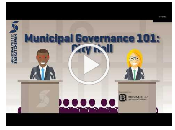
Municipal Governance 101: Introduction to Local Government