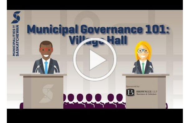
Municipal Governance 101: Village Hall