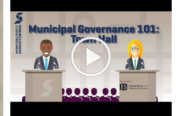
Municipal Governance 101: Town Hall