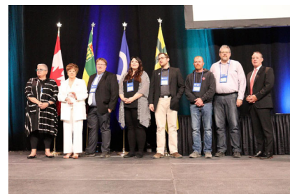
Regional Cooperation Award: