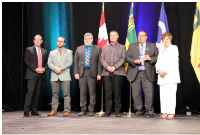
Top Municipal Initiative: New Mechanical Wastewater Treatment Facility City of Lloydminster

The annual SUMA convention is a chance to share ideas. It's also a time to recognize the work being done in our hometowns. On April 16, at Convention 2024, winning urban governments received their Saskatchewan Municipal Awards. Winners from Saskatchewan's rural municipalities received their awards in March at the SARM Convention.