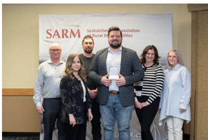
Top Rural Initiative:

Replacement of the old rink with a new state of the art recreation facility that supports the health and wellness of the community and has increased tourism to the area. The centre contains a walking track, NHL sized ice surface, Multi Purpose Gym, Climbing Walls, Simulator room, and more.