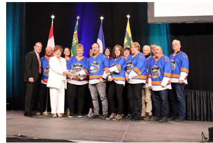
Top Urban Municipal Initiative: Southland Co-op Centre Town of Assiniboia

Created a new multi-jurisdictional, bi-provincial wastewater treatment plant requiring collaboration from leaders in all levels of government. Resulting in improved quality of treated effluent entering the North Saskatchewan River and achieving a fair agreement that benefited residents of both Alberta and Saskatchewan residents.