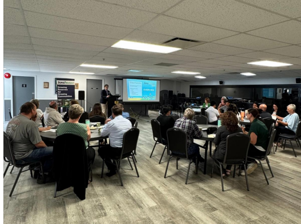
Town of Whitewood

The SUMA Regional Roadshow is sponsored by