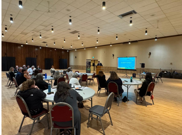
Town of Esterhazy