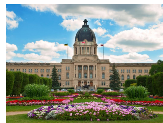
Capital Connections: A Tour of the Legislative Building and