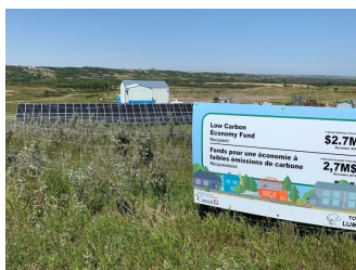
Discover Lumsden: Where Sunshine Meets Spirits in the