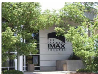
Municipalities of the Future: IMAX and Saskatchewan