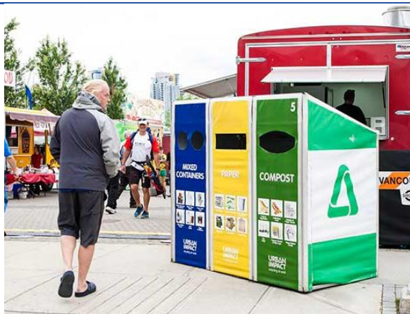
Temporary Festival & Event Recycling Station City of Vancouver