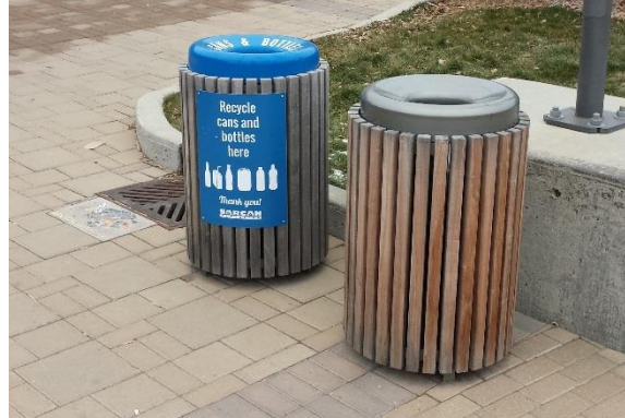
River Landing Bottle Containers City of Saskatoon