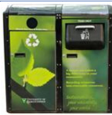
Outdoor Bottle Bin (L) & Big Belly Compactor (R) University of Saskatchewan