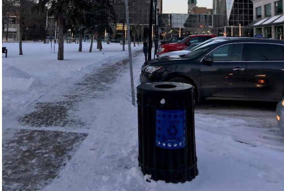
Downtown Bottle Baskets City of Regina