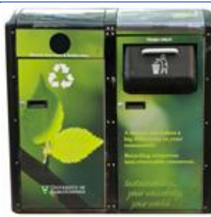
Outdoor Bottle Bin (L) & Big Belly Compactor (R) University of Saskatchewan