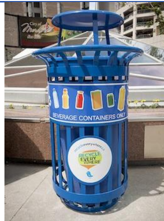
Outdoor Bottle Bins City of Winnipeg