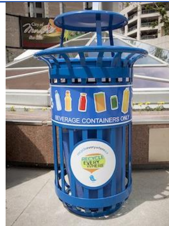
Outdoor Bottle Bins City of Winnipeg