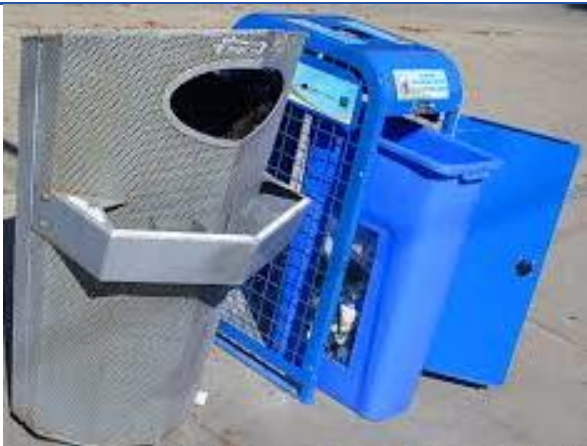
Bottle Trays (L) & Blue Bottle Containers (R) City of Vancouver